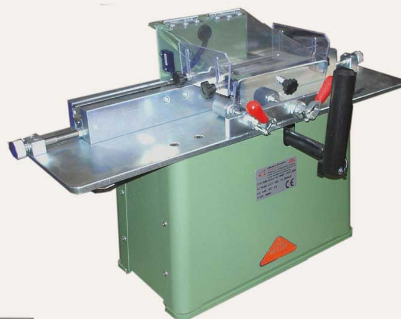
MORSØ Router KSD